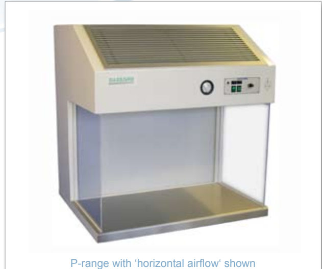
P-range with 'horizontal airflow' shown

Each unit is available with a choice of airflow modes: