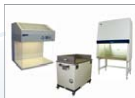
clean air products