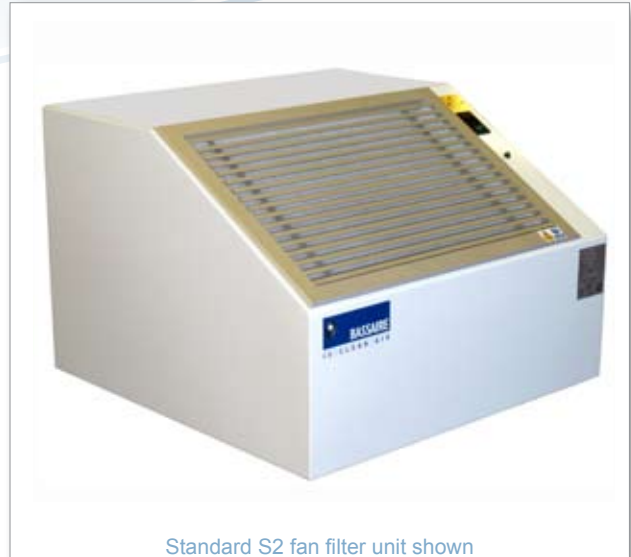
Standard S2 fan filter unit shown