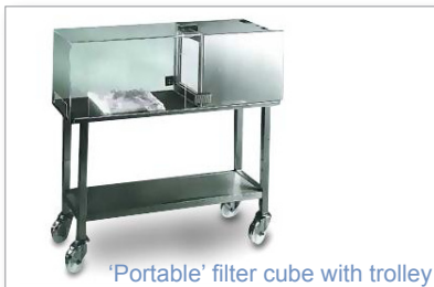
'Portable' filter cube with trolley