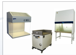
clean air products