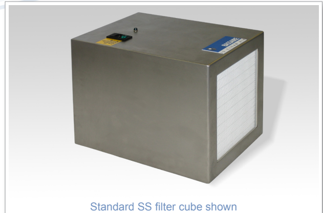
Standard SS filter cube shown