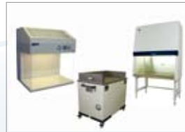
clean air products